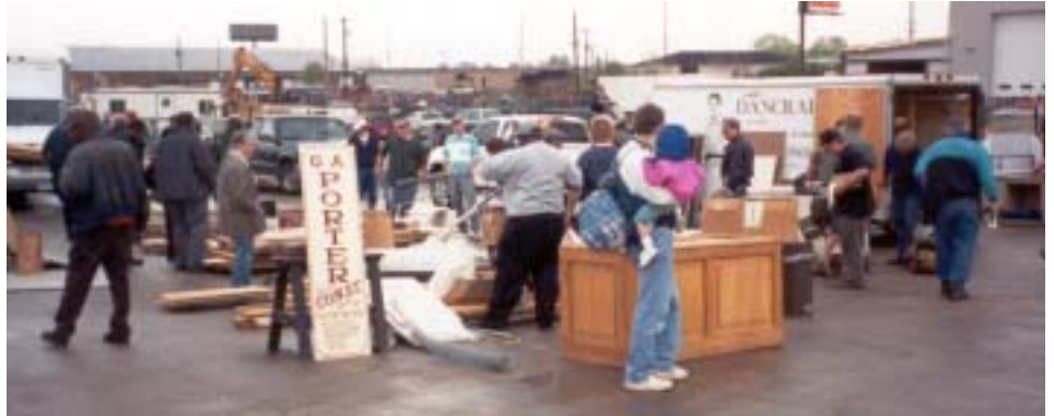
Here is part of the six tons of material and some of the shoppers from 50 nonprofit organizations who met on April 21 at McMRF.

McMRF is a program of the Montgomery County Solid Waste District dedicated to reducing waste disposal problems by making useful